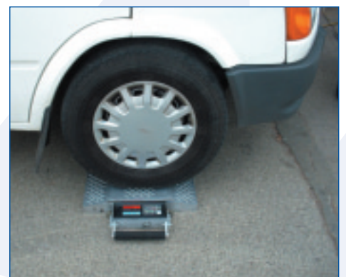
Easily weighs small vans to trucks