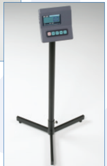
DI-28 Indicator with Stand