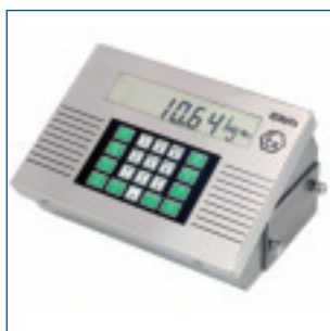
ID3sTx Indicator EX/ATEX Approved