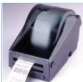
TVP-1000 2" Printer