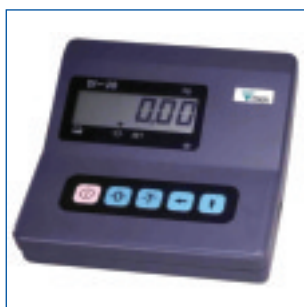
DI-28 Indicator Easy to use with RS232