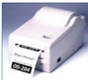
TVP-2000 4" Printer