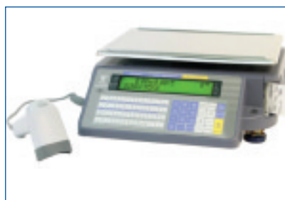
DC-300 – Dual Scale / Counting