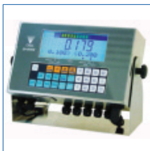
DI-80SS Indicator IP67 Waterproof Stainless Steel